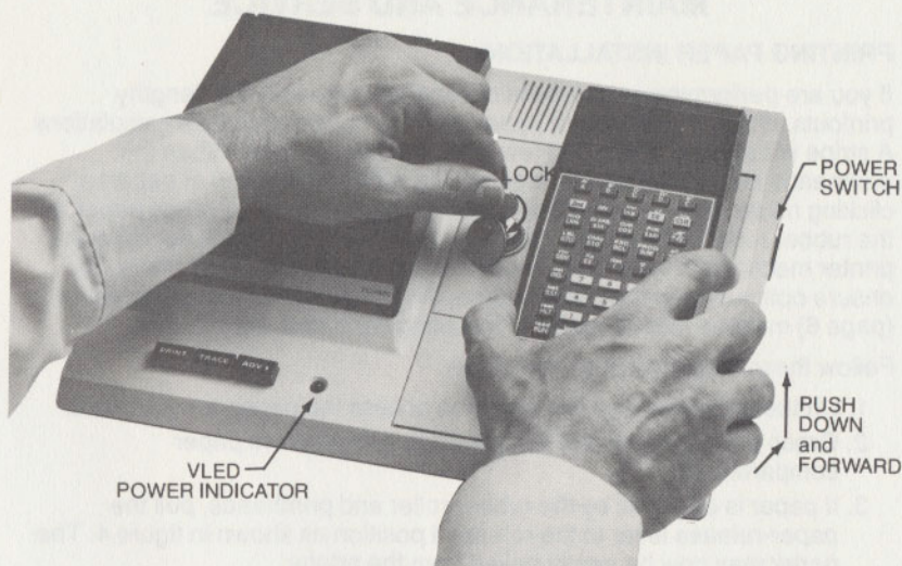
Figure 2 Calculator Mounting