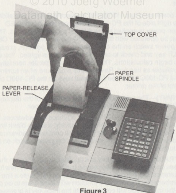
Figure 3 Paper Installation